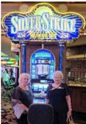
Silver Strikers Club Newsletter - Issue #89

The first two Board members Emeritus were inducted during the June Club event at the 4 Queens in Las Vegas.