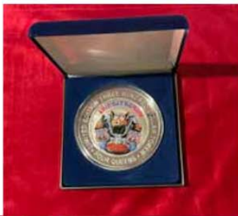
Raffle draw prizes