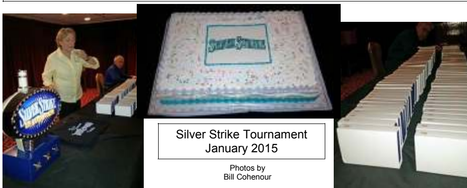
Silver Strike Tournament January 2015