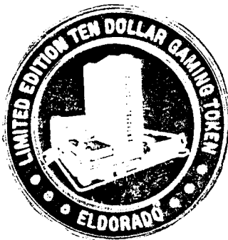
Eldorado bridge "G" mint varieties

What are you looking for when it comes to the Eldorado "G" mint "bridge"?? These pictures should help. The small logo brings a healthy premium - hope you're a lucky one!