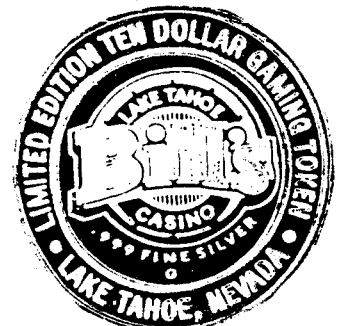
.999 on silver