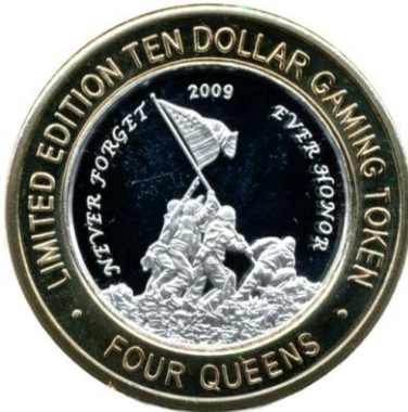
1-Four Queens, Iwo Jima Raising Flag