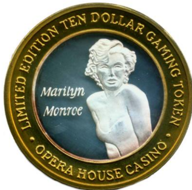
1-Opera House, Marilyn Monroe