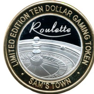
4-Sam's Town, Roulette Wheel