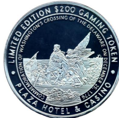
2-Plaza, George Washington Crossing