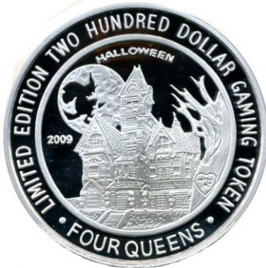
3-Four Queens, Halloween 2009