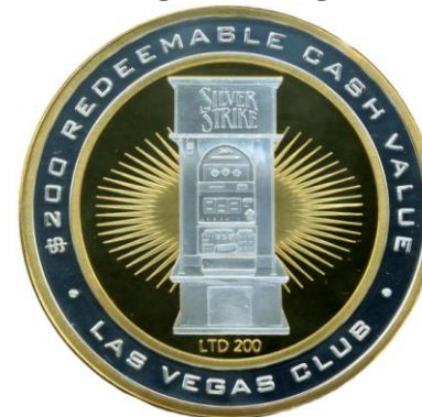
4-Las Vegas Club, Strike Machine