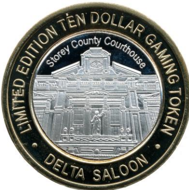
3-Delta Saloon, Storet County Courthouse